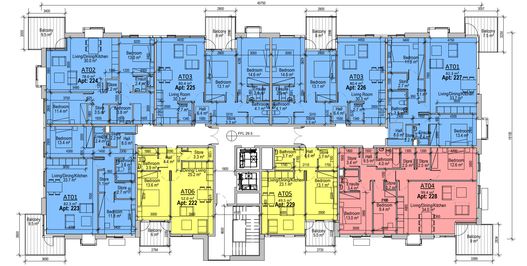
③ Level 02 1: 200