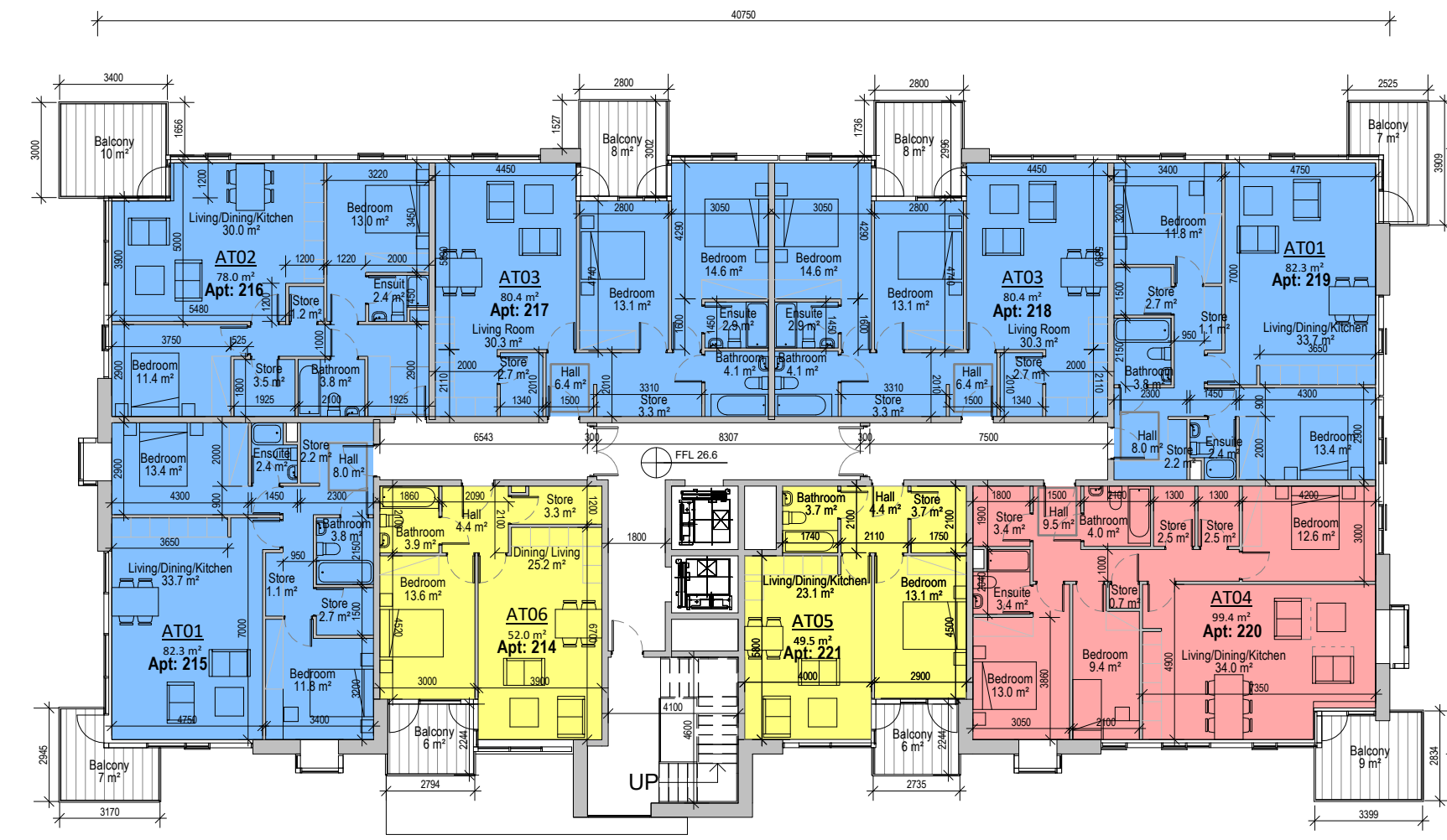
② Level 01 1: 200